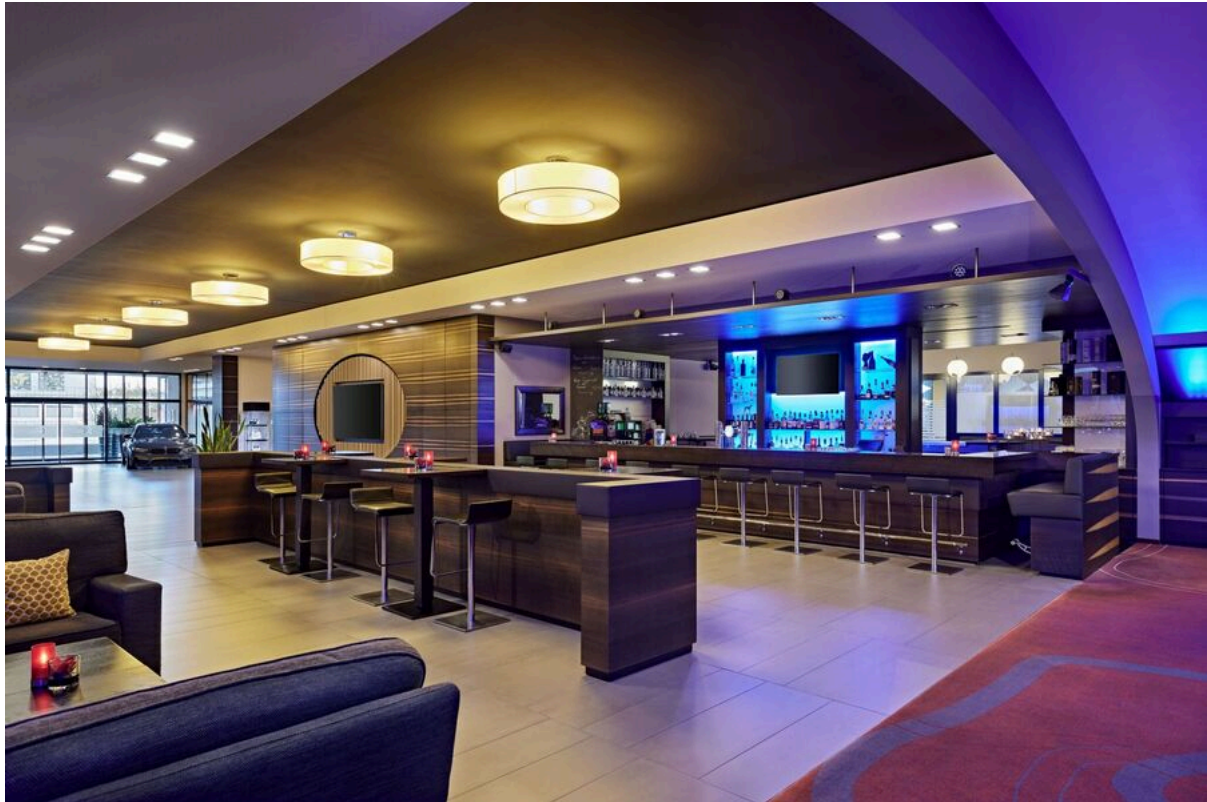
Nürburgring Congress Hotel