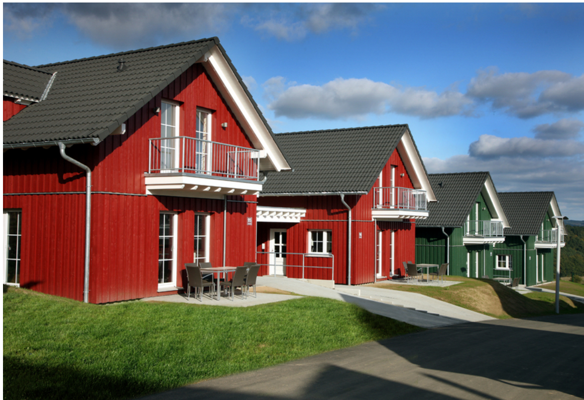
Nürburgring Holiday Park